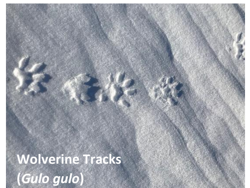
Wolverine Tracks ( Gulo gulo )