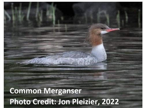
Common Merganser