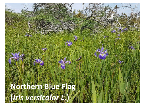
Northern Blue Flag ( Iris versicolor L.)