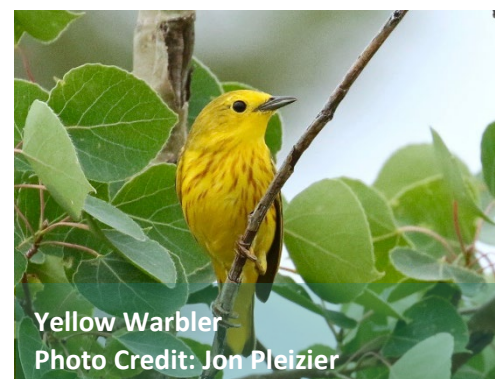
Yellow Warbler